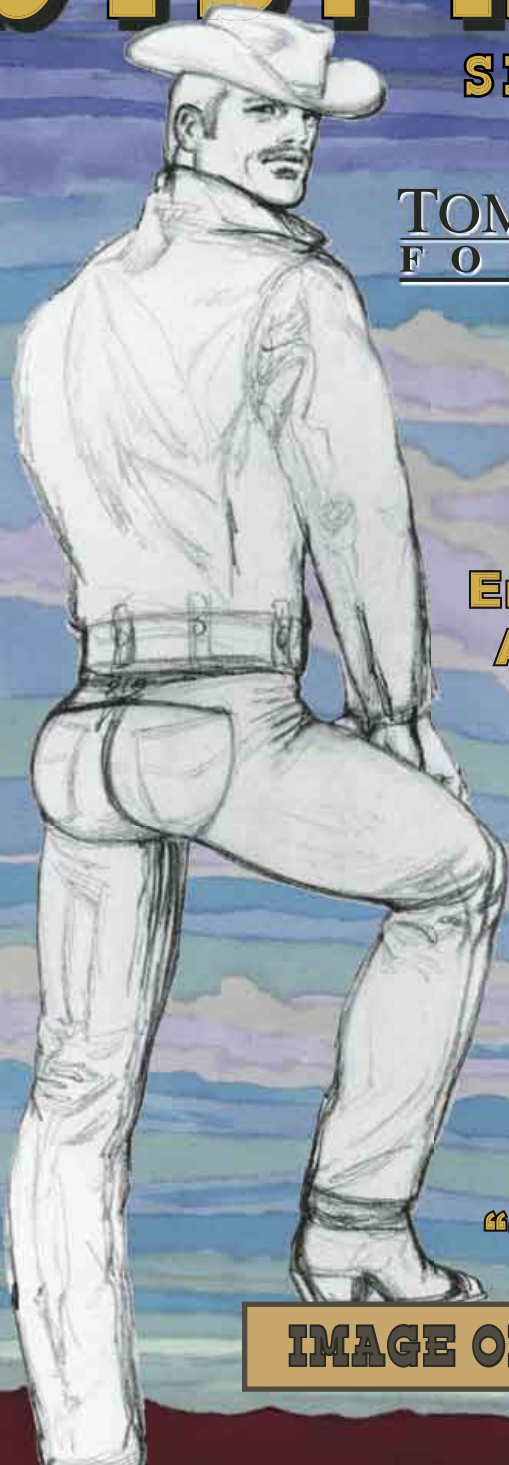
IMAGE OF THE YEAR

Countdown to the New York City Erotic Art Fair Weekend & "Coming of Age"