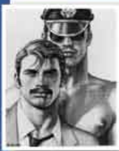
Coming of Age